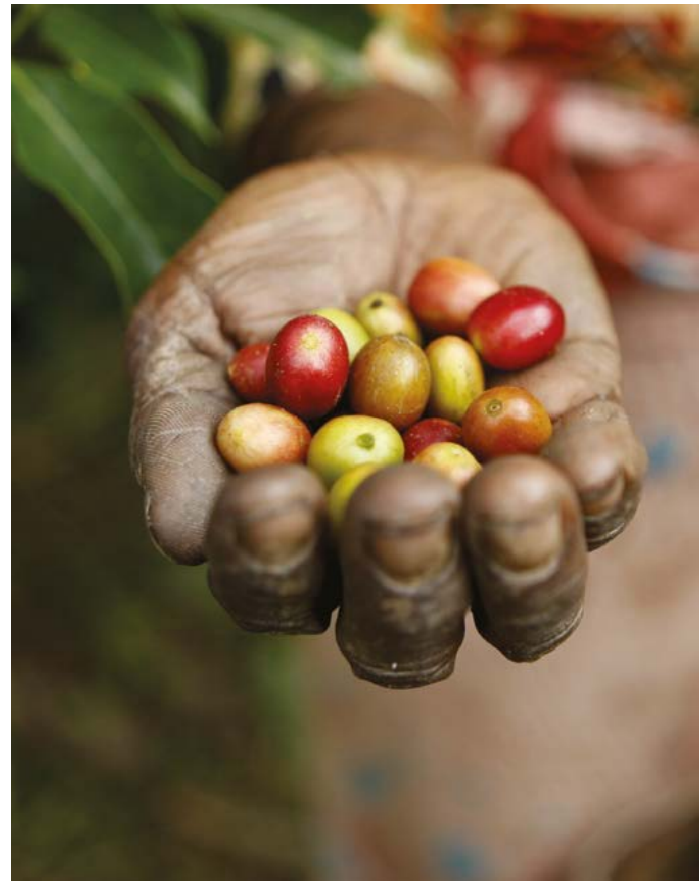
Coffee Pickers in Timor-Leste.