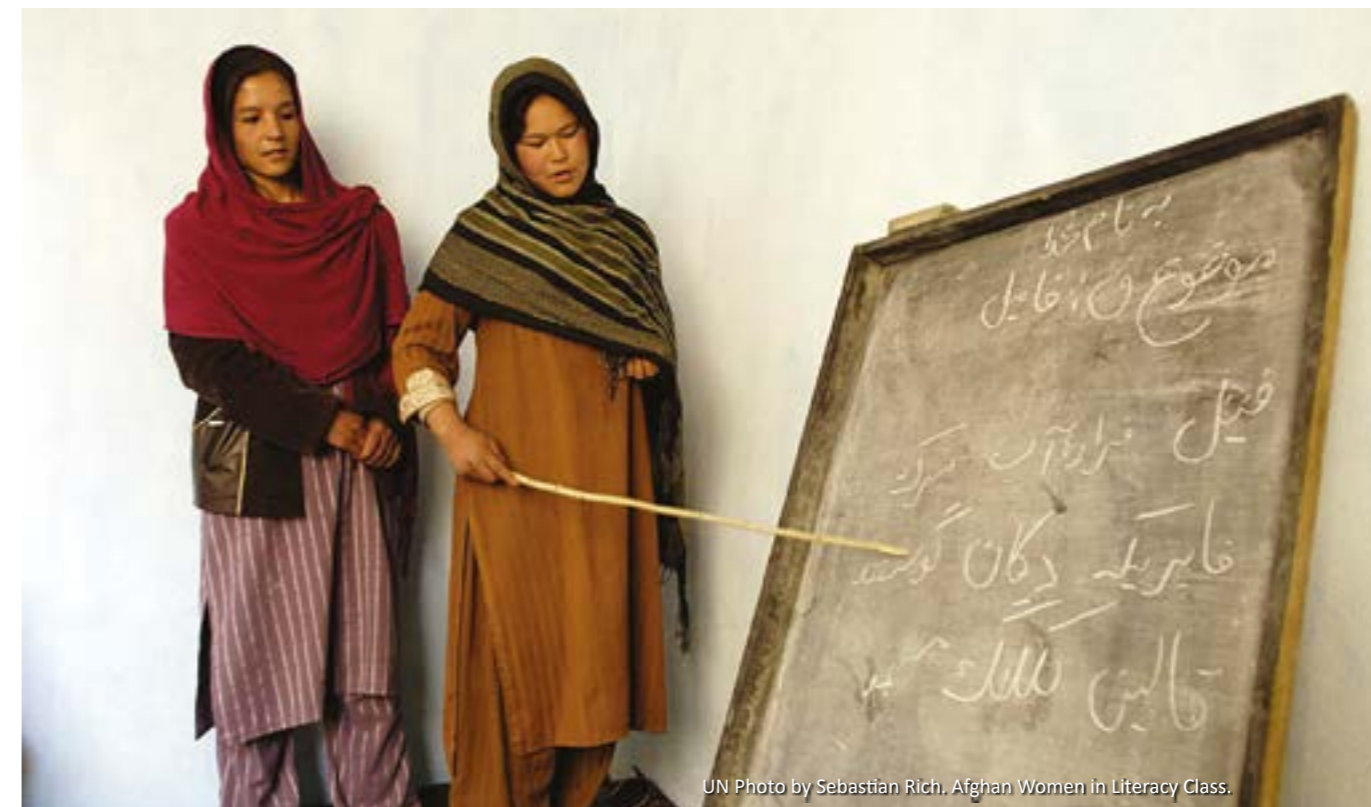
Afghan Women in Literacy Class.