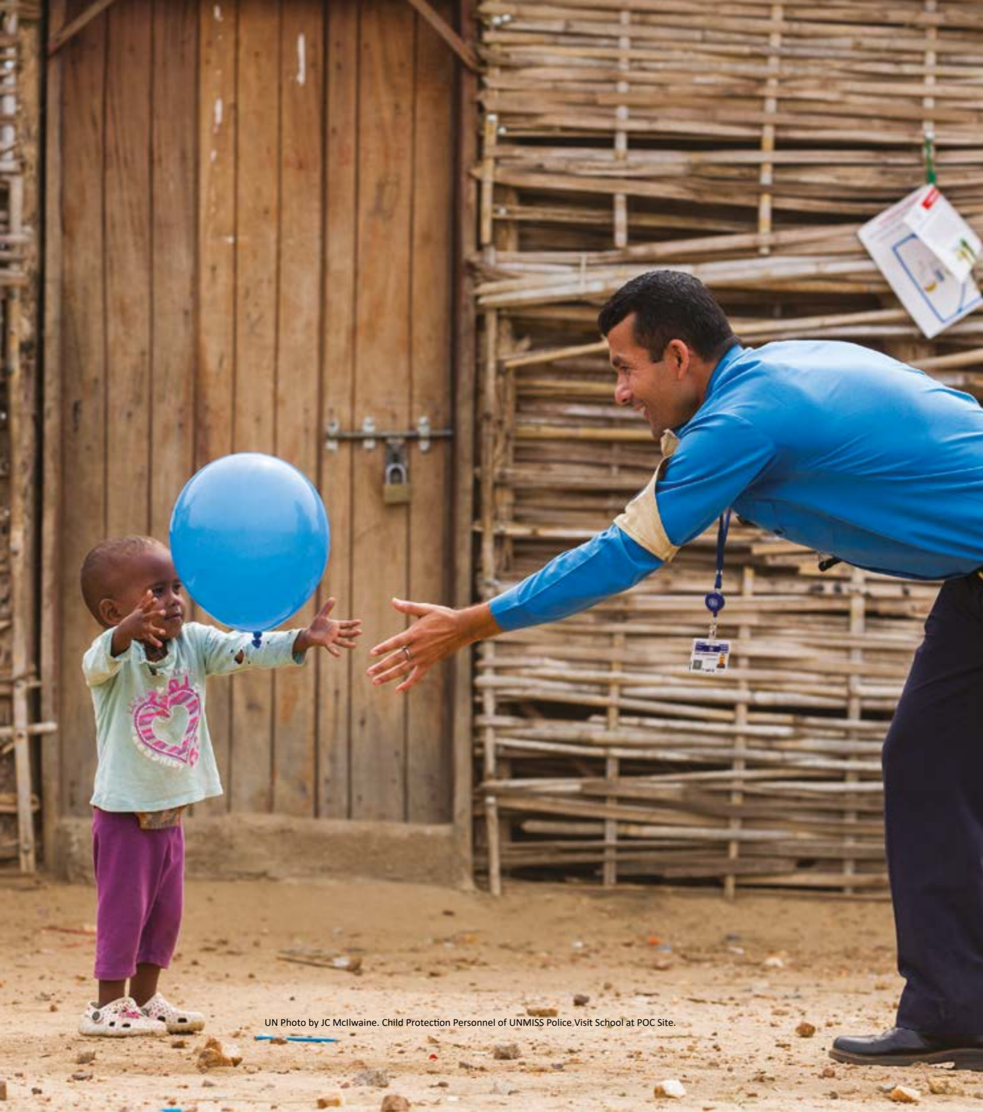
Child Protection Personnel of UNMISS Police Visit School at POC Site.