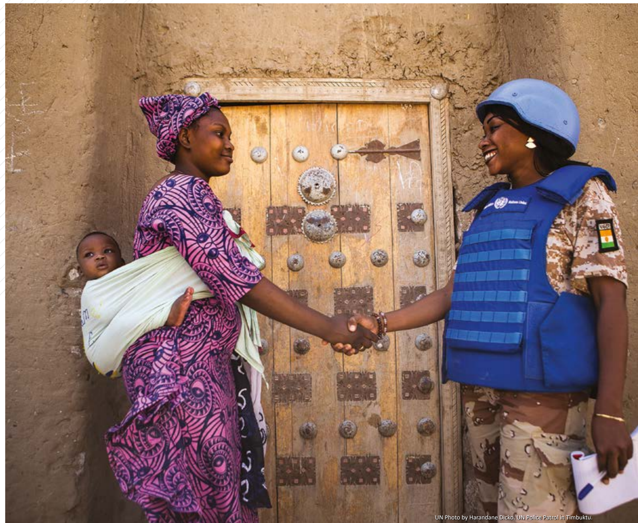
UN Police Patrol in Timbuktu.

Two aspects of SSC are apparently crucial to the kind of action needed in the context of P&D: solidarity, as a value, and proximity (of all kinds), as a reality, both of which seem to be facilitated by regional approaches, although not exclusively so. As mentioned, regional organizations have been at the forefront of key projects and mechanisms in all continents. They have also perhaps been swifter in embracing P&D, even if operational challenges and political obstacles abound. Indeed, we have recently observed the increasing role played by regions in development cooperation, especially in the South, where financial resources are fewer and huge development and security challenges persist.