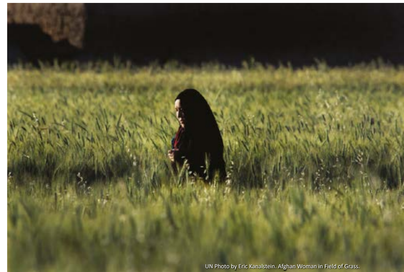
Afghan Woman in Field of Grass.

“The key driving principles of F2F cooperation are voluntarism, cooperation and solidarity. It is unconditional and free from vested interests, whether political or economic. It also refrains from advancing or promoting any specific ideology or approach to development, or one-size-fits-all solutions. Rather, it emphasizes context specificity and country ownership, and believes in supporting the organic evolution of local responses in order to meet local challenges”. 96