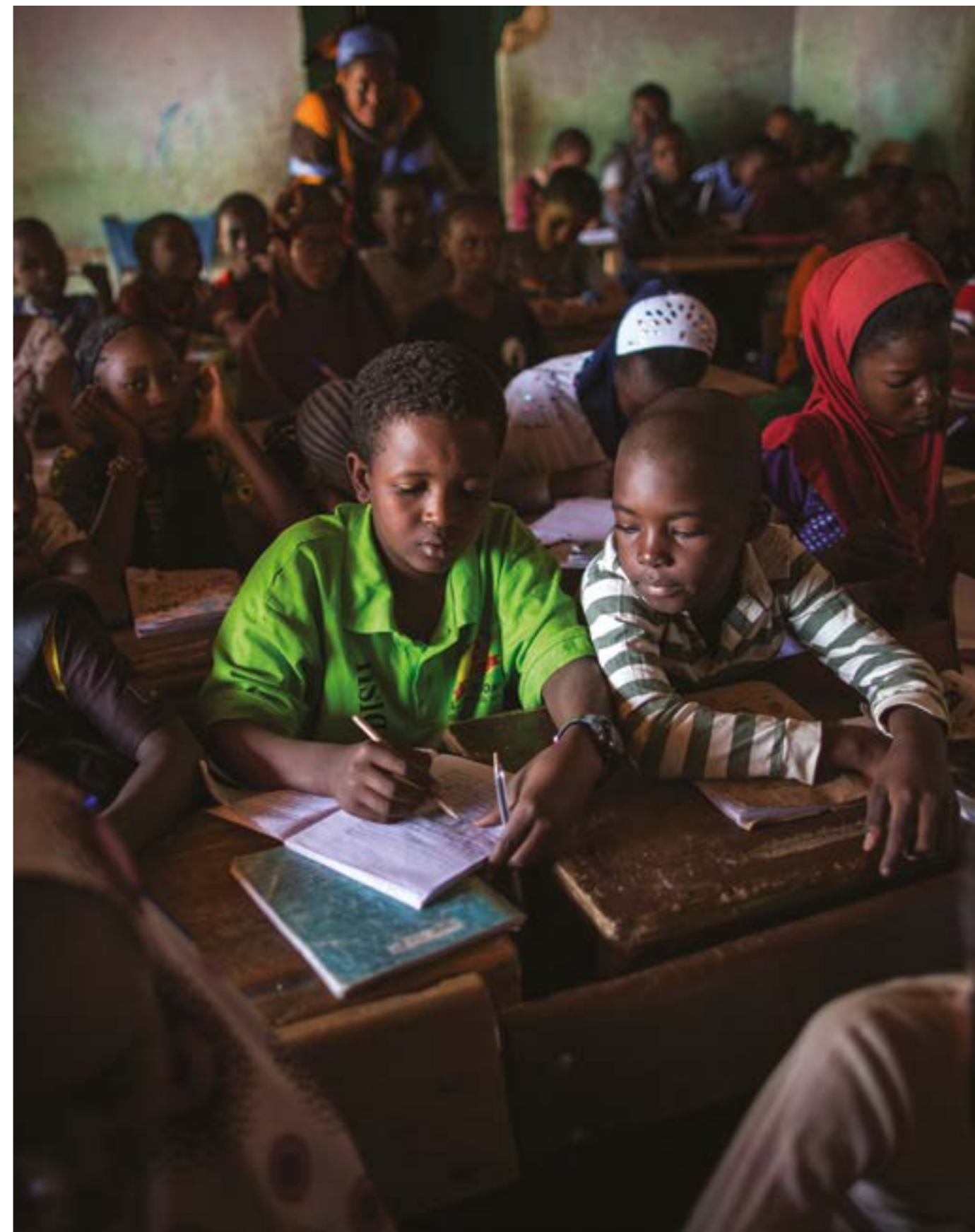
Scenes from Life in Gao, Mali.