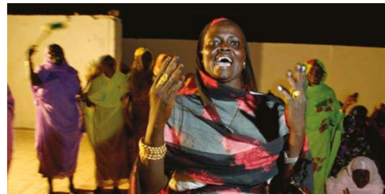
Women Rehearse for Peace and Reconciliation Performance in Sudan.

If we do not galvanize this willingness to act now, when we have strong cases and favorable inclination of the field, not only might SSC fail to occupy the important role it can occupy in the global partnership for the SDGs and, consequently, for P&D, but it might also lose momentum by side-stepping the challenge that is becoming central to the current agenda.