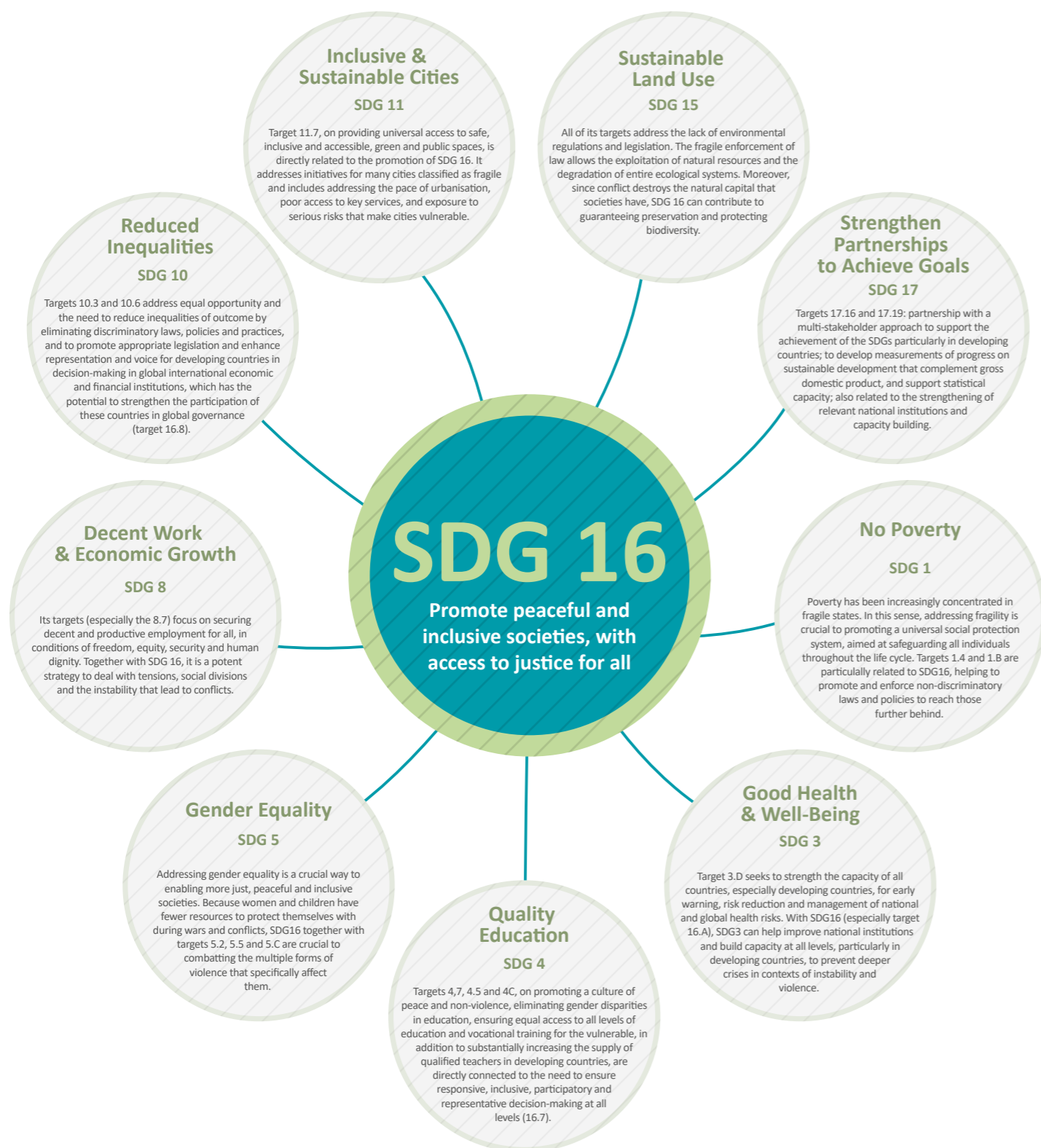
Figure 1: SDG16 and specific targets of SDGs 10, 11, 15 and 17.