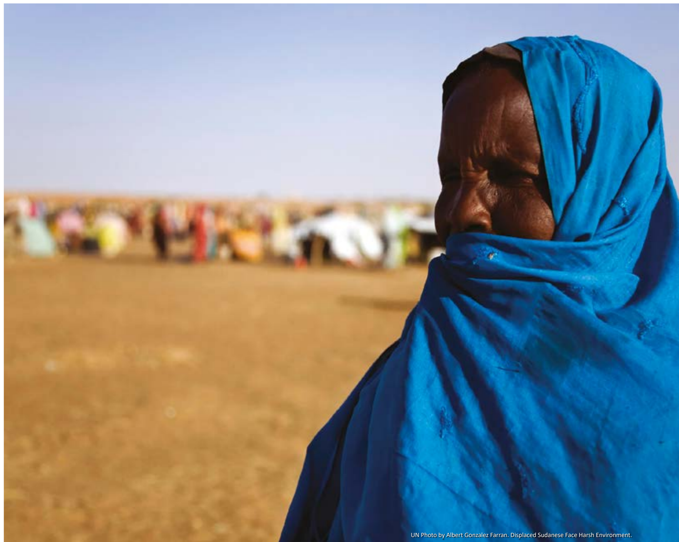
Displaced Sudanese Face Harsh Environment.