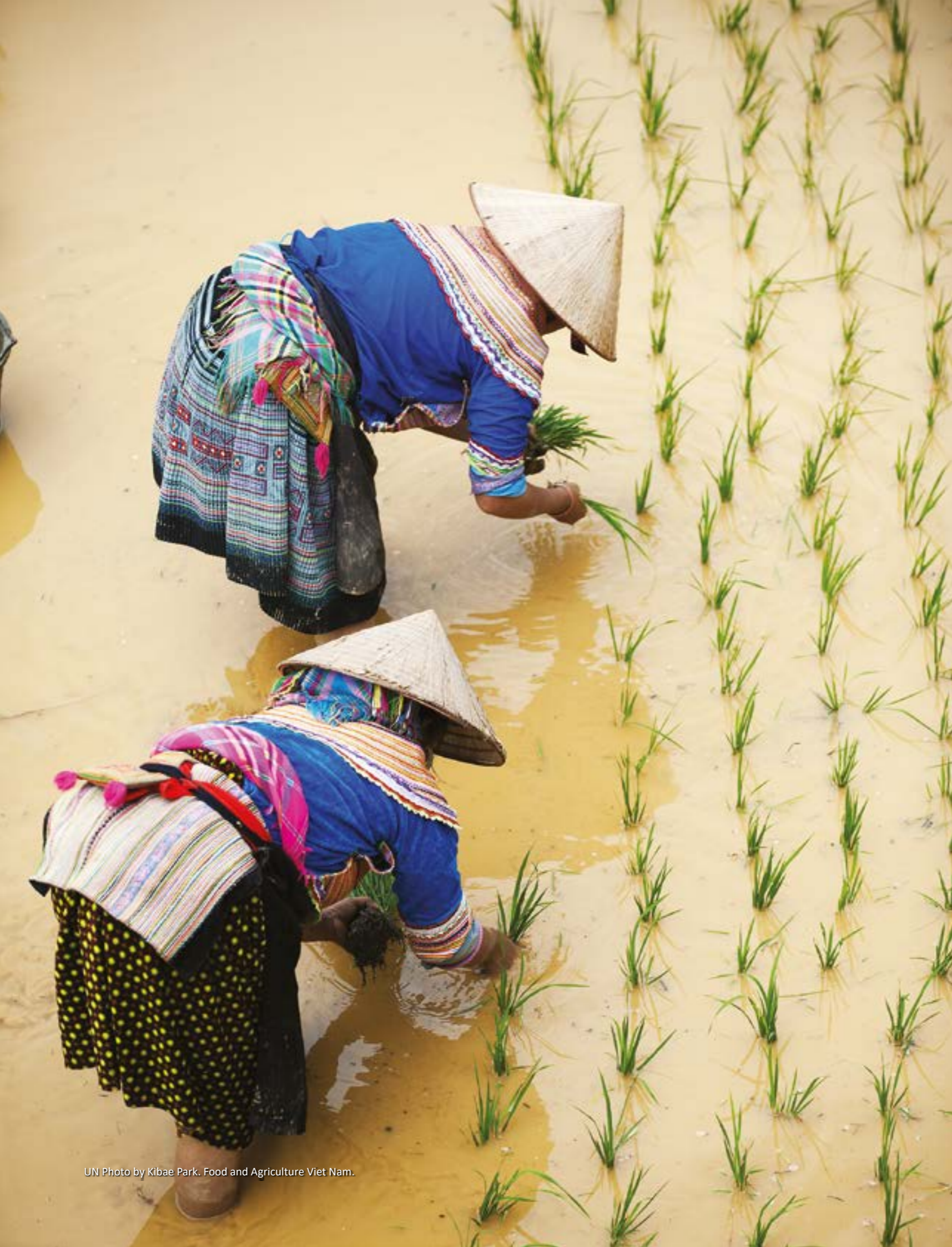
Food and Agriculture Viet Nam.

Proximity, nevertheless, also occurs, if there is political will and the proper support. A characteristic of SSC is precisely peer-learning , a focus on exchange, being together and dialoguing, which does not require much financial support but does require political will. Indeed, “[p]articularly at a time of global austerity, SSC shows mutual complementarities