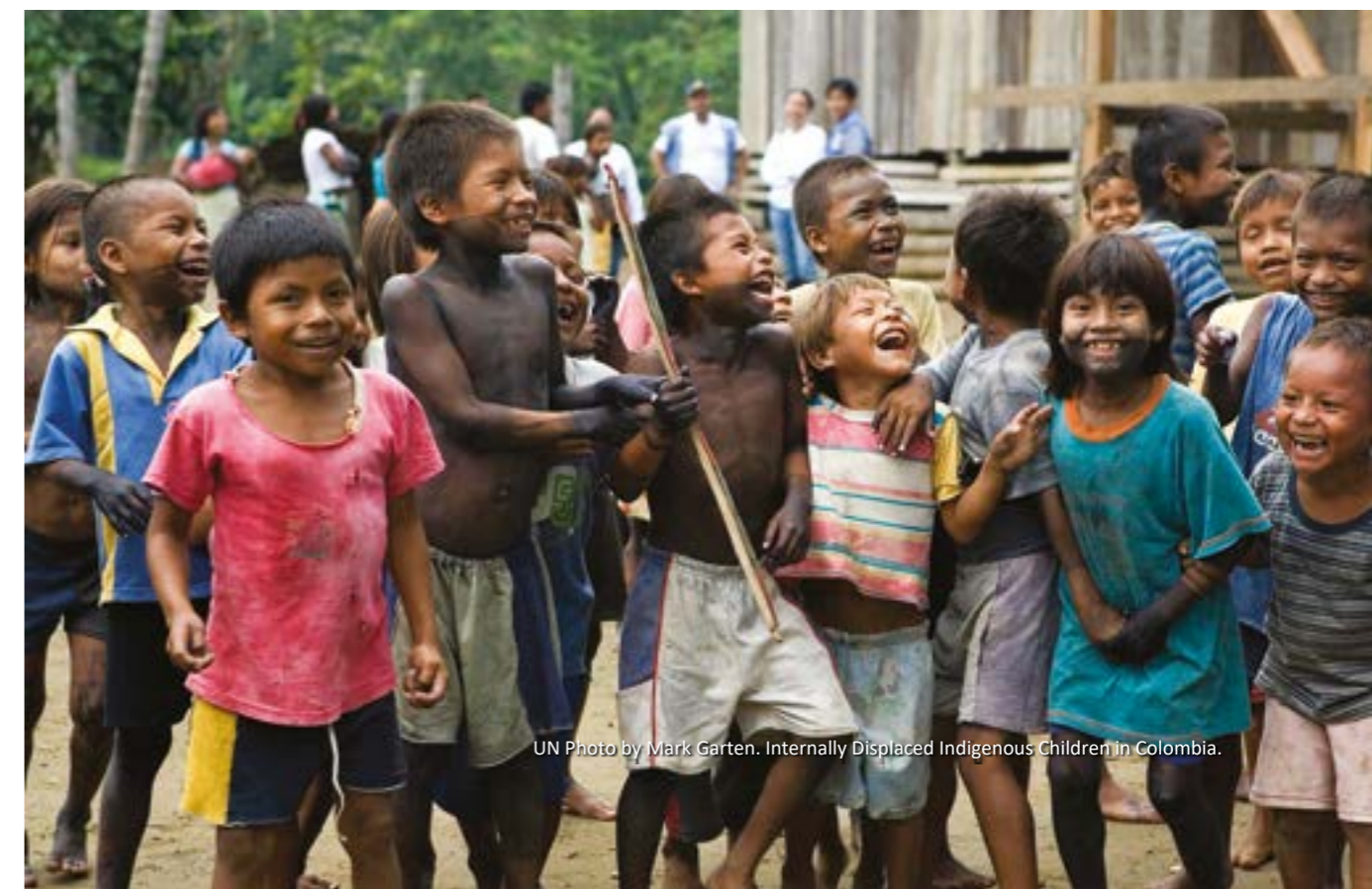
Internally Displaced Indigenous Children in Colombia.