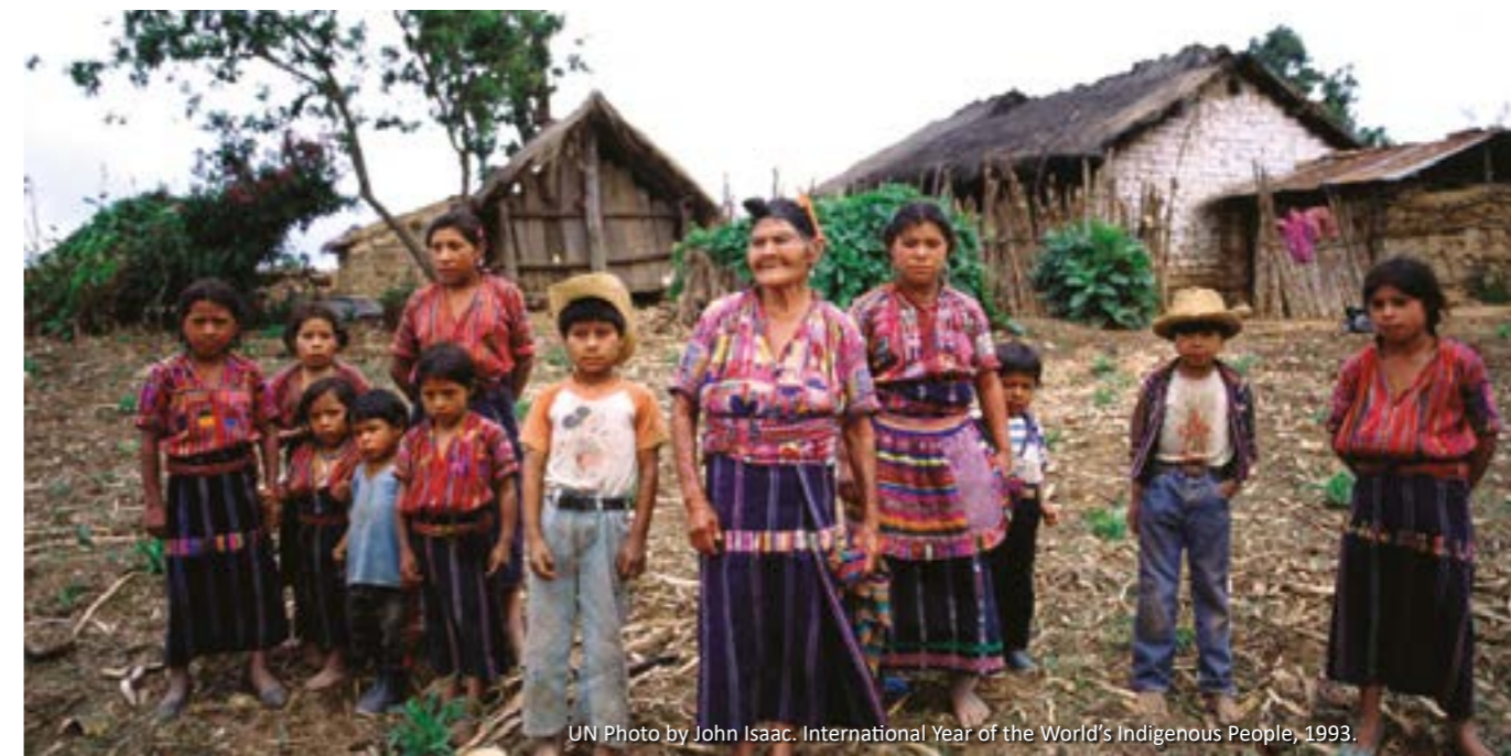
International Year of the World’s Indigenous People, 1993.

At this stage, these are important indications that P&D has gained momentum, and it will be important to observe how sustaining peace takes shape. While sustaining peace is not expressly part of the 2030 Agenda, SDG16 is; and its progress review in 2019 at the High-level Political Forum might provide important insights into where the discussion on peace is going in the development agenda. We would point at two possible conceptual alignments in the future: it seems the old concept of positive peace is an important building block of both sustaining peace and SDG16. 56 In Galtung’s 2011 article derived from his seminal work, three types of positive peace are named in terms of cooperation, equality and a culture of peace. 57 By uniting cooperation and equality, and giving culture a central role, positive peace feeds into sustaining peace with what in fact is the understanding that has been historically manifested in the principles of SSC, at least in theory (more on this ahead). Moreover, sustaining peace implies deliberate policy