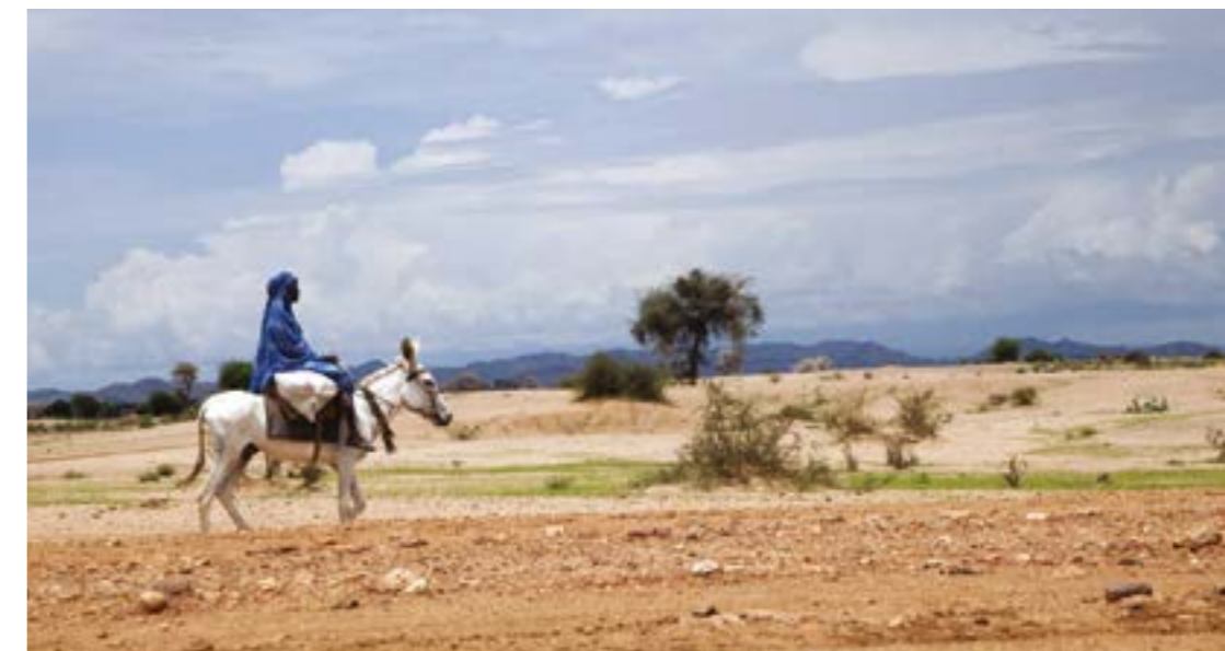
Displaced Darfuris Farm in Rainy Season.

actors. 24 Meanwhile, practitioners on the ground have several examples of SSC on P&D in hand. Dispersed research shows that SSC has been central in key moments of tension in the South, and an increasing mobilization towards more contextual and nuanced understandings of peace, 25 as with the concept of sustaining peace (more on this ahead), has meant that several projects for which implementation through SSC is already complete or underway in areas that are key to promoting social cohesion are acknowledged as vital contributions for peace. It is crucial that knowledge production in the areas of SSC on P&D follows progress that is taking place in practice, and that this knowledge be systematized and disseminated.