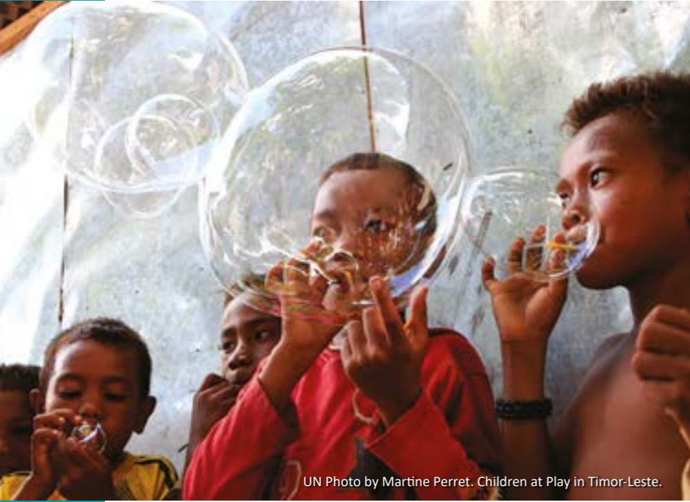
Children at Play in Timor-Leste.

As explained in the text, this table is here offered as an annex for further consultation and research for those interested. It is not in any way an exhaustive table: it does not include all countries and organizations and documents were randomly chosen by date and subject. We understand these are perspectives, not commitments nor fixed positions, as such policy debates tend to be continuously changing. We have quoted directly from the documents in columns “(Sustaining) Peace Definition” and “Actionable Proposals”, although the titles of these columns are our own. Any text in the last column that were not originally in English were translated by us. The “Key Ideas” are based on our reading of these documents. The “Website” is the source of the public document. All documents are publicly available. We intended with this that one can grasp the definition of peace broadly being mobilized in each specific case and that, with the last column, one can have an idea of how the specific applications of these definitions vary. We hope the table offers a path for further research.